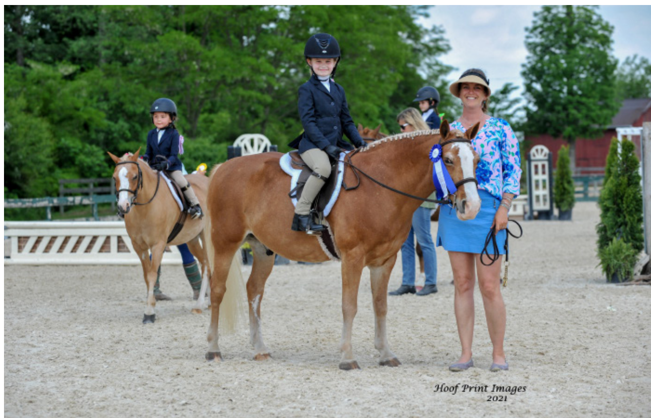
Hoof Print Images 2021