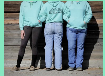
Trail Hoodie Sizes: S-5XL

Offering Kids, Mens and Womens in 20+ colors!!